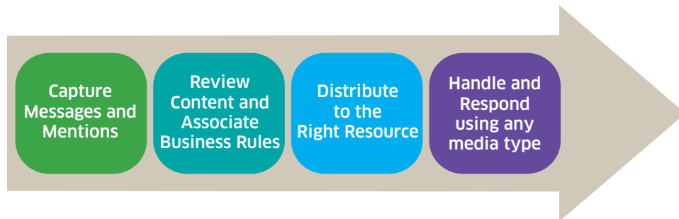
Figure 1: Genesys Social Engagement enables management of social media communication for one conversation with the customer

You can think of your social media strategy as four general steps, progressing from passive listening to active customer engagement and integration.